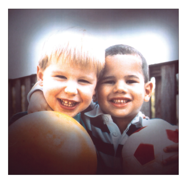
Vision with advanced glaucoma