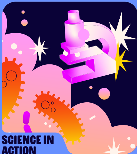
SCIENCE IN ACTION