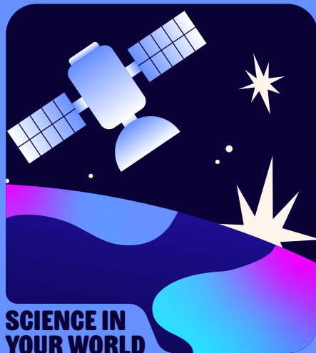
SCIENCE IN YOUR WORLD