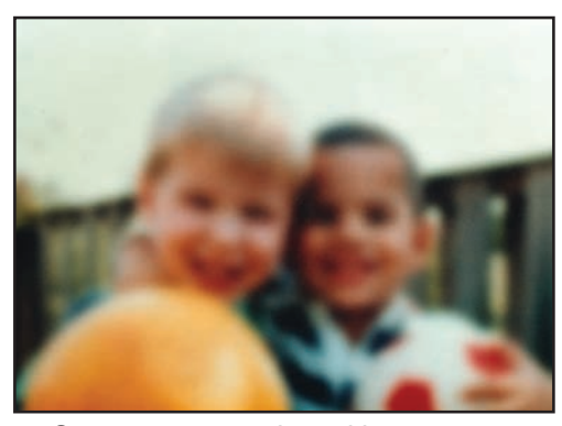
Same scene as viewed by a person with advanced cataract.