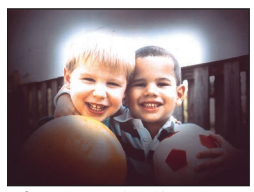
Same scene as viewed by a person with advanced glaucoma.