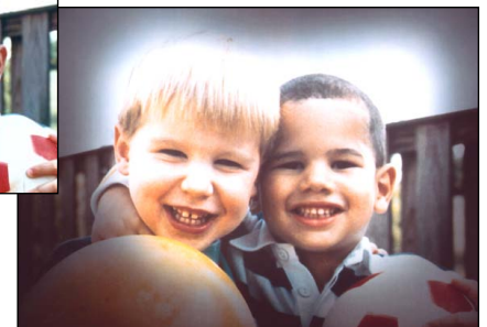
A scene as it might be viewed by a person with glaucoma.